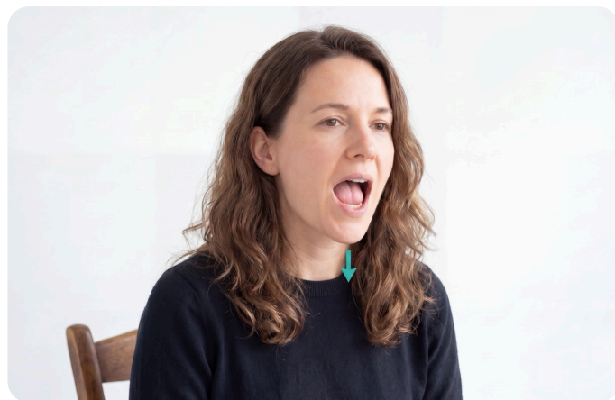
OPEN MOUTH, TONGUE STAYS UP