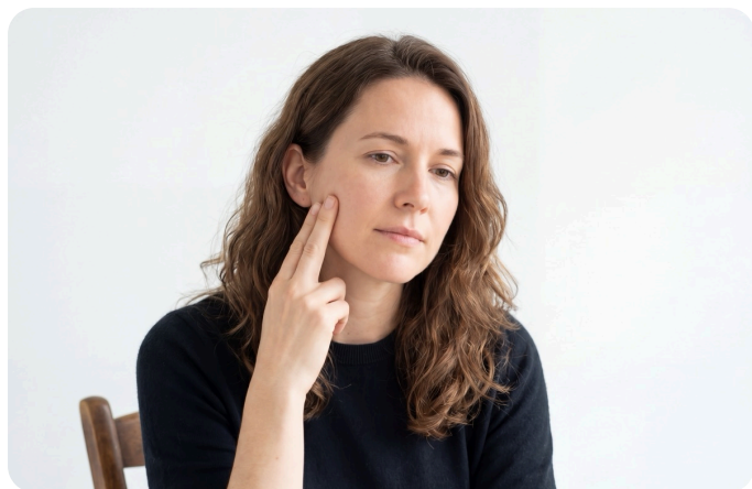
LOCATE THE MUSCLE

Gentle soft-tissue release for jaw tension