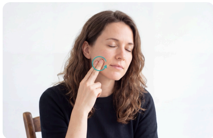
APPLY CIRCULAR PRESSURE