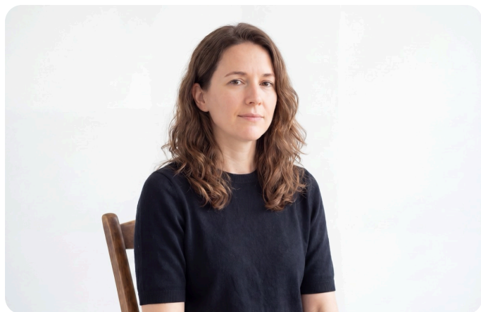
TONGUE ON ROOF, MOUTH CLOSED

Controlled jaw movement to improve range of motion