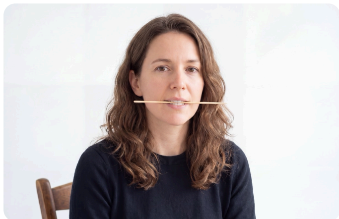
STICK ON TEETH, JAW CENTRED

Guided side-to-side jaw movement for mobility